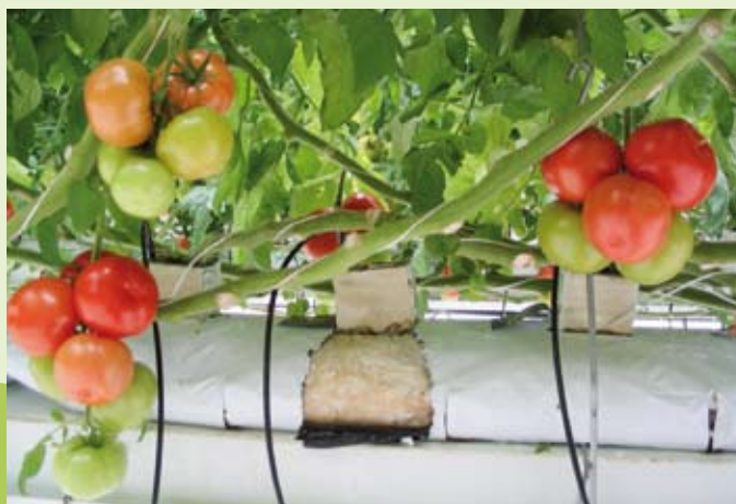
Very healthy, high yielding tomatoes growing in FytoFlake.