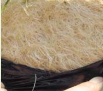
FytoCELL grown plants develop fine feeder root systems that ensure maximum nutrient uptake – unlike traditional substrates