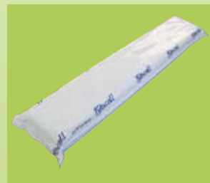
FytoSlab 900 x 180 x 80 mm