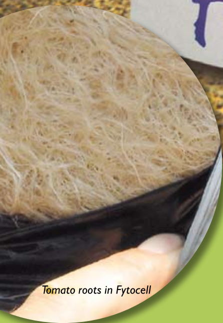
Tomato roots in Fytocell