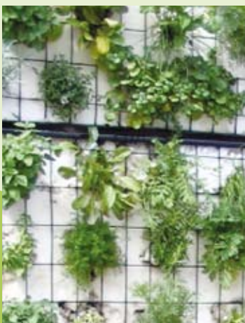
Herbs growing in a FytoSlab wall.

Grower feedback to date indicates both FytoFlake and FytoSlab provide a barrier to Scarid Fly invasion. Because FytoCELL is non fibrous Scarid Fly have difficulty penetrating the FytoCELL.