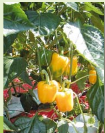
Healthy capsicums with a good fruit set growing in FytoFlake.