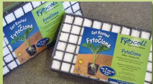
FytoClone 72 cell insert and perforated tray